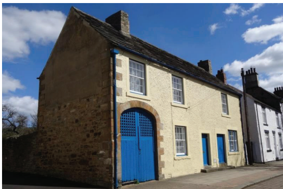
Fig 16. 39 Front Street, formerly the Post Office

3.41 The long established parish centre of Lanchester had a full complement of trades and shops until the 1950s, with a livestock mart, agricultural merchant, chemist, hardware, several food shops, blacksmiths, undertakers, cobbler, doctor, post office & telephone exchange, dress makers, police station, lock-up and court house, four places of worship, Co-operative store, two butchers, four pubs, several transport firms, three garages, three schools, a vet's surgery, two banks, two solicitors, a land agent, two cemeteries and a bus company – in effect a town in miniature!