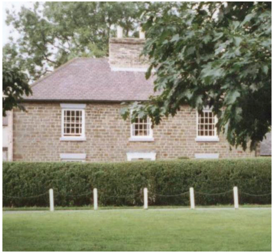
Fig 14. Brookvilla, in a prominent position on the Village Green

3.35 Population expansion and rise of entrepreneurs in Lanchester in the late 1800s is reflected in the building of new private homes and farmhouses. An example of workers housing is the very attractive and distinctive Hollinside Terrace built in 1892, however it is exceptional accommodation with an interesting story.