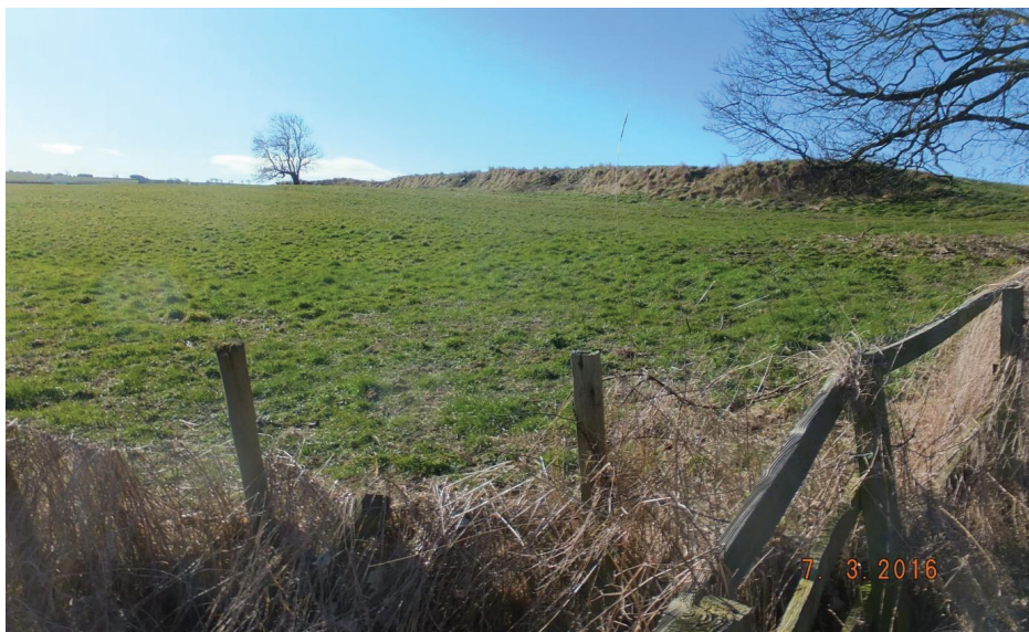
Fig. 31 LHA 127 View south west looking from the direction of Colepike Road, away from the village and towards Cadger Bank and the Roman Fort.