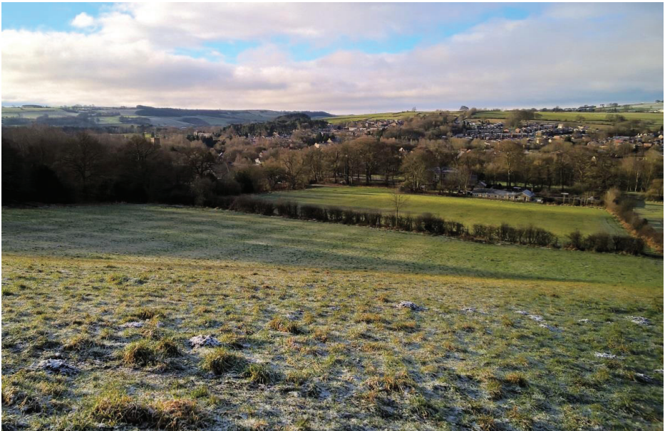
Fig. 26 LHA 49 View from Paste Egg Bank over village