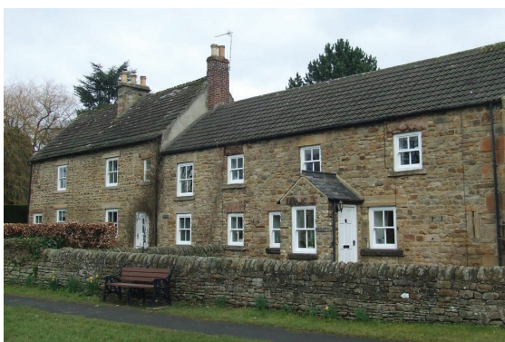
Fig 12. The Deanery Farmhouse

3.28 Much of the higher land was fell and in common occupation until the two main Enclosure Acts, of the late 1700s, created the distinctive enclosure landscape of straight roads, regular fields and numerous quarries. New farms were also created on these lands, the most notable being Woodlands, owned by Thomas White, who received many awards from the Society of Arts, for his planting, drainage and farm works.