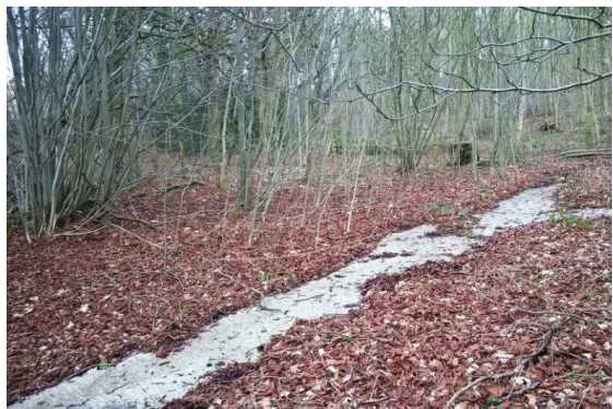
Fig 15. The site of Fenhall Drift Mine, now landscaped and wooded

3.37 The early history of industry in the parish begins with extractive mining and quarrying activities. There was a major iron working site at Sheepwalks Farm at Longedge, and it is recorded that Roger of Colepike supplied iron to the Bishop in the 15th century. Coal is reported to have been found in the Roman Fort, and was certainly being worked in the parish, during late Medieval times. The great period of coal working was in the 19th century, when the railway infrastructure allowed for the cheap transport of fine quality coking, household and steam coals from this area. Considerable numbers of miners lived in the parish, and by the 1930s, 40% of the working folk, registered with the Labour Exchange at Lanchester, were employed by collieries in the area.