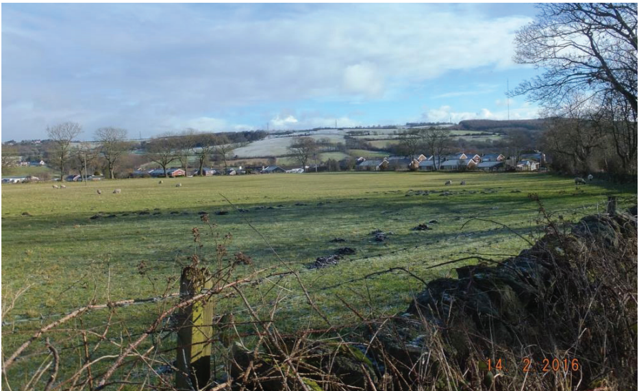
Fig. 33 LHA 128 Views either side of Newbiggen Lane, midway between Margery Flatts and the Ridgeway