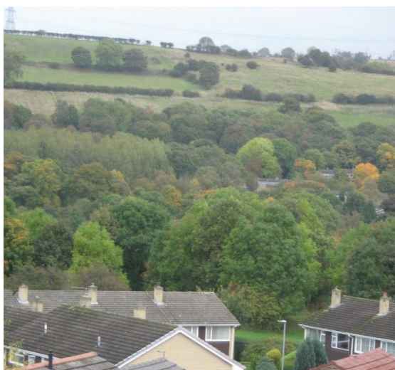
Fig. 7 Deanery Wood, one of the last areas of ancient wood in the parish; Deanery View estate nestles on its edge.

3.17 There is little remaining ancient woodland apart from Deanery Wood, Loves Wood and tracts at Malton. Smaller pockets can be found but these are not recorded. A significant contribution to habitat is provided along the wide verges of roads in the west of the parish which were created during the enclosure acts. Brownfield sites also present good habitat opportunities and the vacant land at Malton Colliery is particularly attractive to many species. Natural heritage is constantly evolving and requires adequate consideration and resources if this asset is to withstand further erosion.