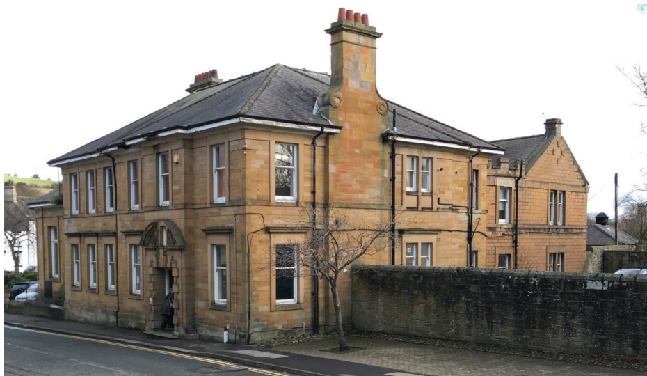
Fig 5. The Workhouse Boardroom, now a library

3.13 Within the village itself, the 19th century brought a wealth of new building, both to provide accommodation and to house trade, but also in the civic sphere. The large Lanchester workhouse boasted several buildings in the heart of the village, including the Board meeting rooms which now house the library. Lanchester was a judicial centre for West Durham and held petty sessions. Chapels and a parochial school were built. The population was growing, as was prosperity, aided in part by the new transport networks such as the Witton Gilbert to Shotley Bridge road, and the Durham to Consett railway, both of which crossed the village, the latter bringing slate for roofing, replacing earlier pantile roofs.