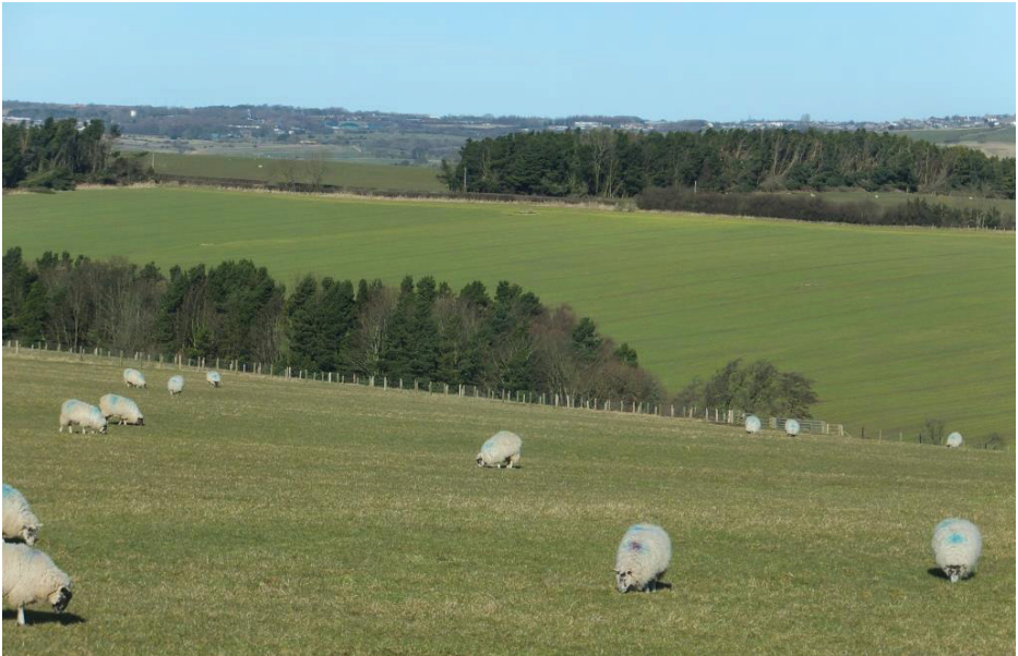
Fig. 34 LHA 130 Views either side of Newbiggen Lane up to Humberhill Lane showing several plantation tree strips between fields