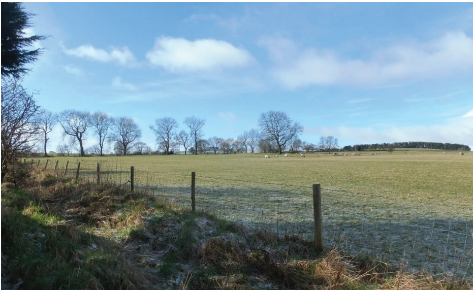
Fig. 23 LHA 197 View from the Ridgeway to the west, over countryside and the valley