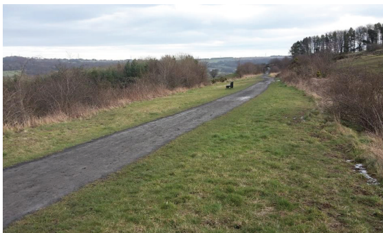
Fig 8. The old railway line, now a much used and well-loved footpath

3.18 The parish is traversed by innumerable footpaths which cover a wide-ranging landscape . It is possible to follow a number of circular routes which encompass significant historic attributes of the parish. To the northwest of Lanchester, Greencroft estate includes a network of footpaths through the remnant designed landscape which formed the setting to Greencroft Hall, built in the 17th century for the Clavering family, but later demolished. North east from the village a series of footpaths give access to Black Wood with views out to rolling pastoral land.