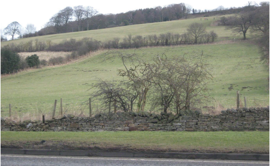
Fig. 27 LHA 115 View north east from Lanchester Bypass (A691), over the landscape to the east of the village