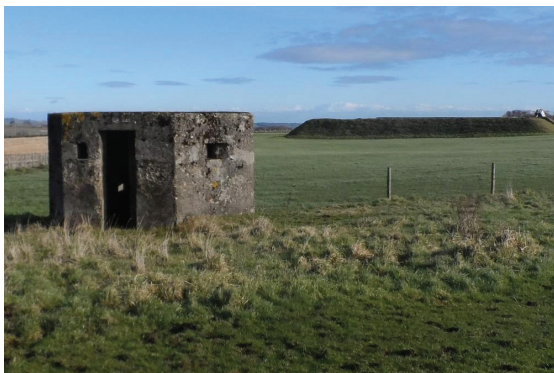
Fig 18. Pillbox at Burnhill Ammunition Storage Depot, hidden in the west of the parish