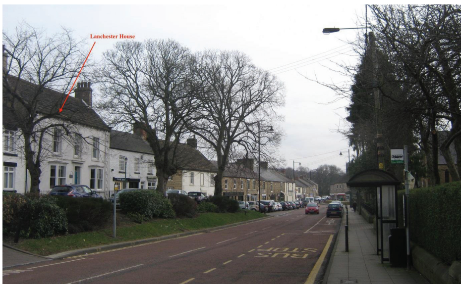
Fig. 29 LHA 46 View south east from Lanchester House, through mature trees to the village centre