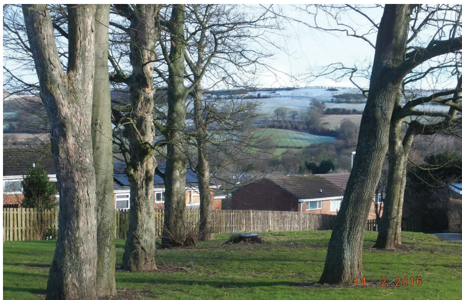
Fig. 24 LHA 198 View and open space from Briardene cul-de-sac looking north west