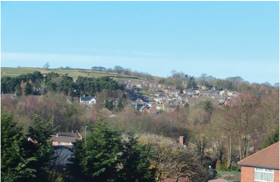
Fig. 32 LHA 126 View west from Deneside across the village