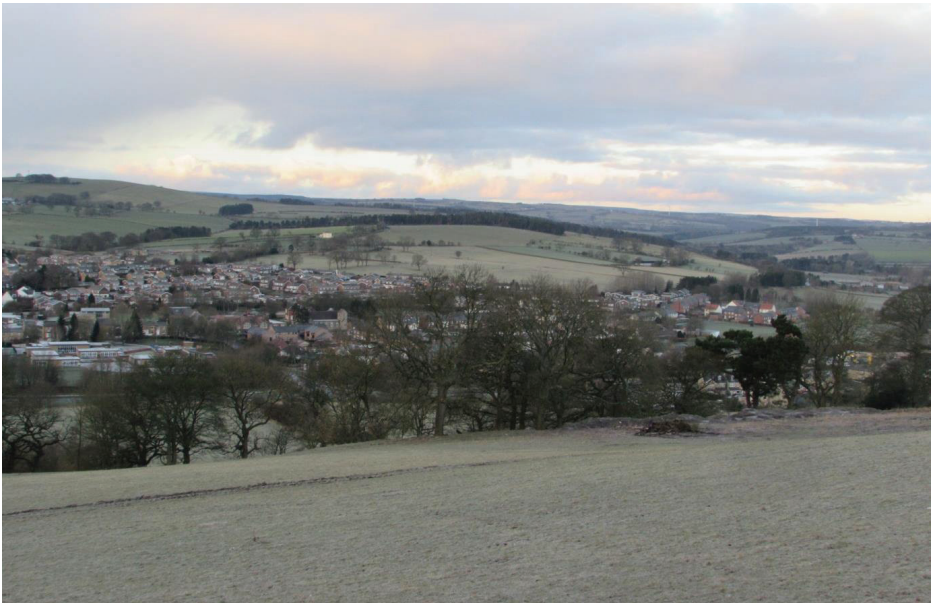
Fig. 22 LHA 71 View south and west from NZ17058 48049, over village and fields