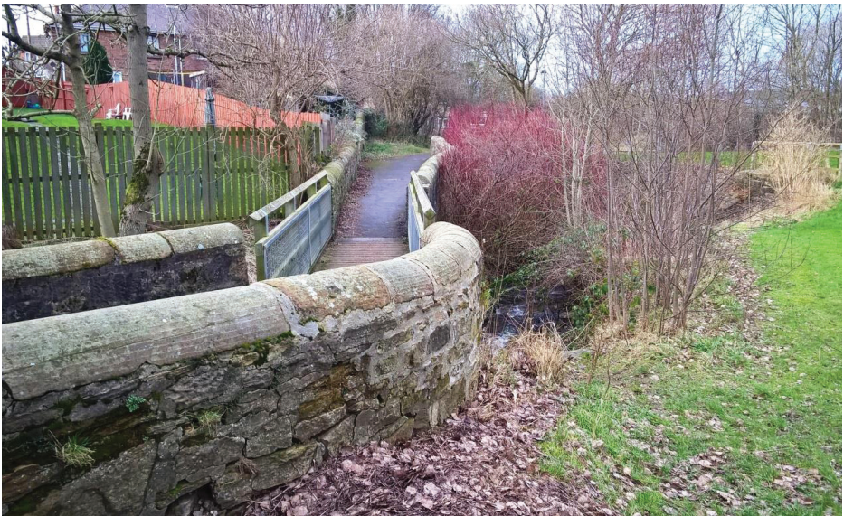
Fig. 35 LHA 100 View over open land including Alderdene Burn off Broadoak Drive