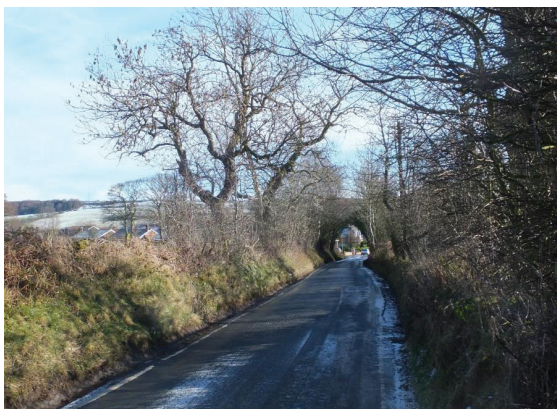
Fig 9. Newbiggin Lane, one of the many drove roads crossing the parish

3.20 Dere Street is the most significant roman route which passes through Lanchester although it is no longer a public route, passing almost undetected through farmland. A drove road between Scotland and England runs through Saltersgate plantation at the extreme western edge of the parish.