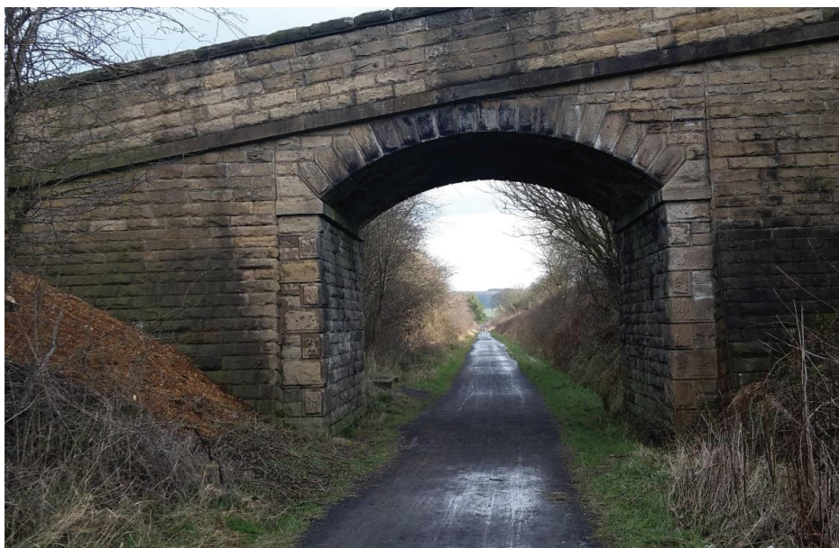
Fig. 20 LHA 75 View east and west at Knitsley Viaduct