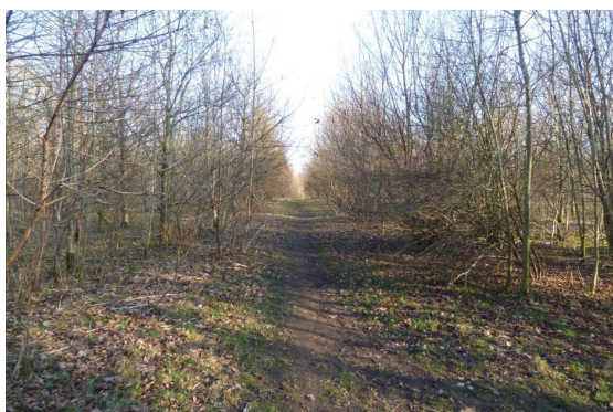
Fig 6. Dora's Wood, and example of new natural heritage created by the local community, planted in 2001

3.17 There is little remaining ancient woodland apart from Deanery Wood, Loves Wood and tracts at Malton. Smaller pockets can be found but these are not recorded. A significant contribution to habitat is provided along the wide verges of roads in the west of the parish which were created during the enclosure acts. Brownfield sites also present good habitat opportunities and the vacant land at Malton Colliery is particularly attractive to many species. Natural heritage is constantly evolving and requires adequate consideration and resources if this asset is to withstand further erosion.