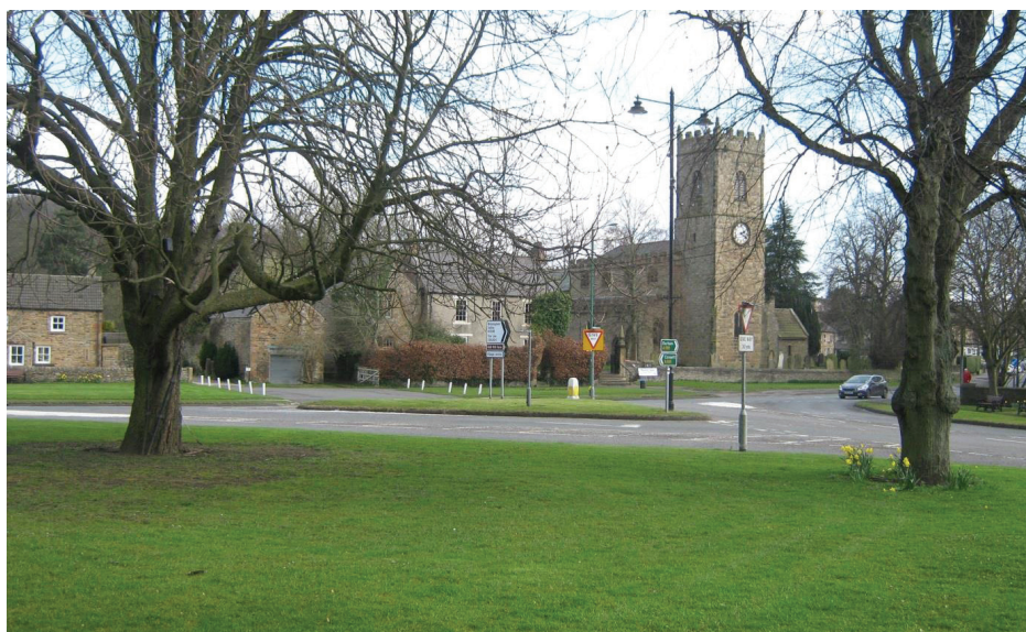
Fig. 25 LHA 68 View from Front Street looking north-east towards Black Woods.