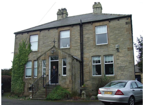
Fig 13. Hollinside Hall, built for John Urwin, Coal Owner

3.34 In early 1600s there is evidence of mine workings, and on a map of colliery workings for Durham circa 1650 Lanchester is described as a mining village. At this time, miners usually lived in poor accommodation close to the mine face. The evidence of a mill and quarrying indicates more