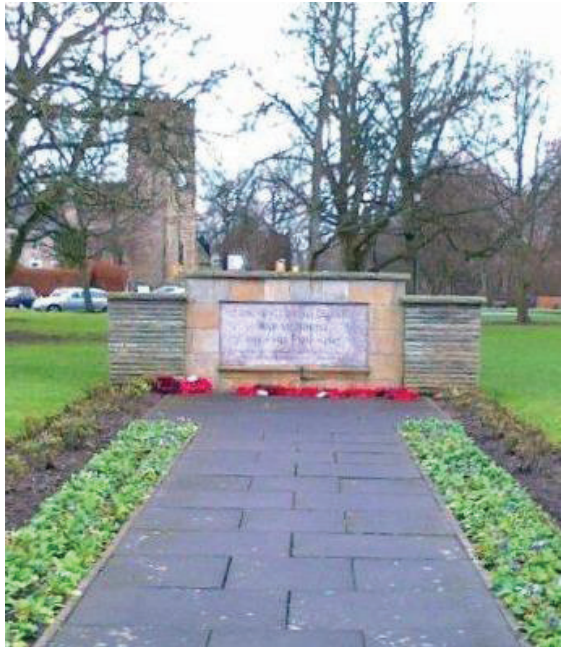
Fig 10 War Memorial on the Village Green

3.22 There are a number of memorials in Lanchester ranging from the listed monuments associated with the Grade 1 listed All Saints Parish Church to the memorials to the fallen of the two world wars. Within the church a memorial also exists to William Hedley of locomotive fame who lived in Burnhopeside Hall a few miles south of the church. The world wars had a significant impact on Lanchester and there are two very visible memorials. Above the steps leading up to All Saints Parish Church on Durham Road is the Memorial Gate unveiled in 1922. Adjacent to Brook Villa on the north west side of the village green is the Lanchester and District War Memorial, unveiled in 1951 and moved to its present location in 1972. In addition there are a number of plaques in the Roman Catholic All Saints Church, the Community Centre and All Saints Parish Church.