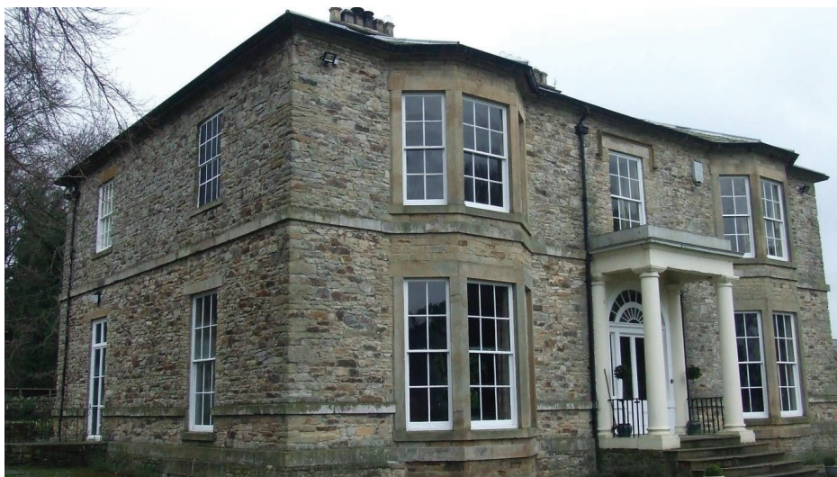
Fig 4. Woodlands Hall, built by landscape designer Thomas White

3.11 By the mid-18th century, new houses were being built in Lanchester itself, around the village green and on Front Street, with surrounding hamlets, farms and steadings scattered across the parish. The Enclosure of the Parish in 1773 led to the creation of the landscape seen today, with rough fell land brought in to new agricultural field systems, miles of stone walls and fences constructed, and new roads and lanes criss-crossing what was once common land. Large houses, such as Greencroft Hall (demolished) and Woodlands Hall, were built in the village and further afield, some with associated parkland and landscaping, as the Parish moved in to the 19th century.