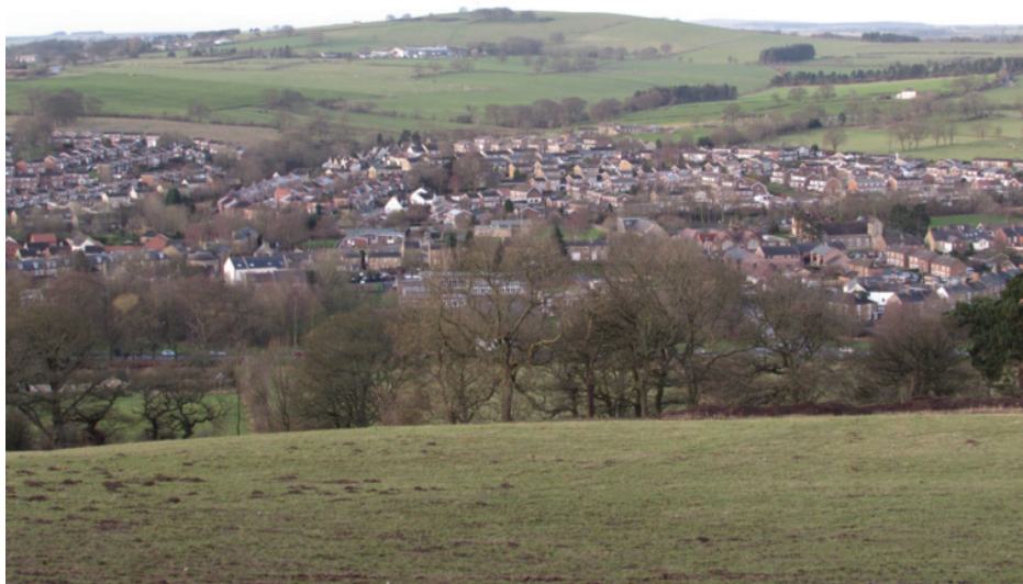
Fig 2. Lanchester village, sitting in a coalfield valley on the upland fringe