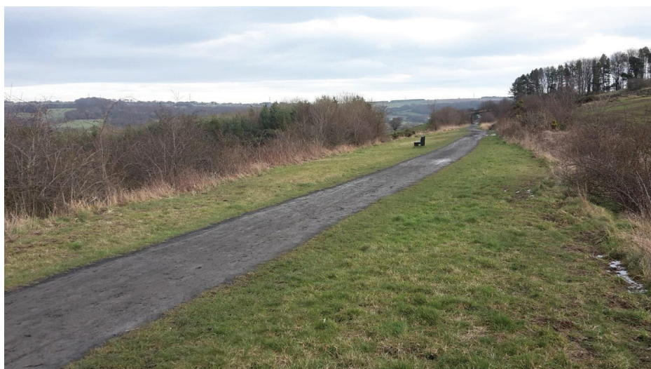
Fig. 19 LHA 42 View east and west along old railway line

3.57 These views are particularly impressive, inspiring and important because they show the characterful setting and rural nature of Lanchester and the clear linkages and connectivity the village has developed over the centuries with its rural landscape, agriculture, and the surrounding countryside rising up from the River Browney valley and beyond. Explicit landmarks and references still exist today within these views that reinforce this relationship established over many centuries and forged since Roman times, through the Industrial Revolution on into the present day. They offer rich enjoyment for many within the community in a diverse number of ways, enabling residents to fully appreciate and marvel at the natural environment in which Lanchester is situated; providing opportunities to observe and connect with the past, reflect on its significance and importance within busy lifestyles and to take time out to think about the present and what the future holds. In addition to being significant as an element of Lanchester's heritage, the views of the Parish also form a vital component in community life today, feeding in to recreation, leisure, and social activities.