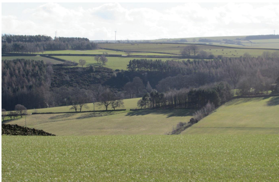
Fig. 36 LHA 103 Views from country road looking south east over farmland, woods, trees and stone walls