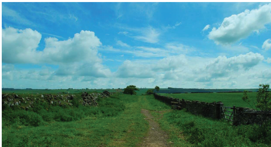
Fig 3. The defensive banks of Longovicium, Lanchester's Roman Fort

auxiliary fort, rectangular in shape with four gates, surrounded by at least one defensive ditch. The fort was occupied through the 2nd and 3rd centuries AD. None of the Roman remains at Lanchester have ever been fully excavated, but since 1990, geophysical surveys have revealed the structure of the fort interior and the extent of the civilian settlement. In addition to the fort and civil settlement, Dere Street, the main Roman road linking York and Hadrian's Wall, ran through the landscape, and infrastructure relating to the water supply for the fort and town still survives in places. There is thought to be a Roman quarry at Peth Bank, but it has not yet been located. The impact of the arrival of the Roman army in the area should not be underestimated, as quarrying, woodland clearance, and cultivation on a large scale would have been necessary to support the soldiers and civilians.