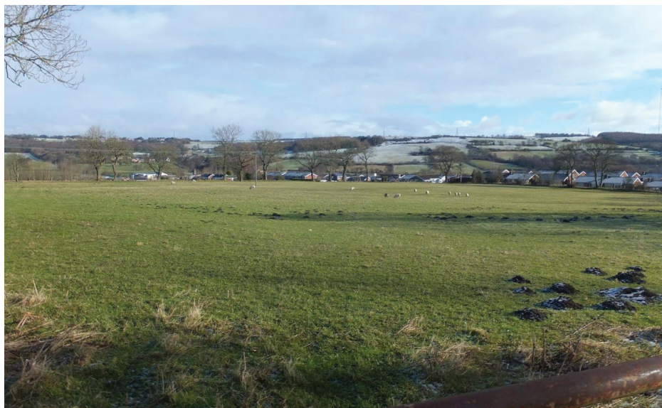
Fig. 21 LHA 122 Views from Margery Flatts in all directions