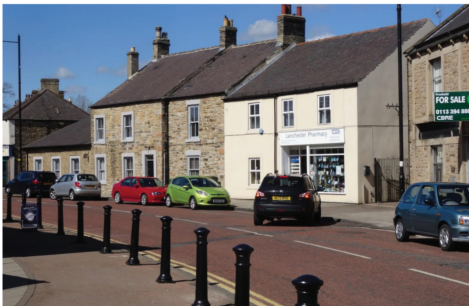
Fig. 28 LHA 86 View of Front Street