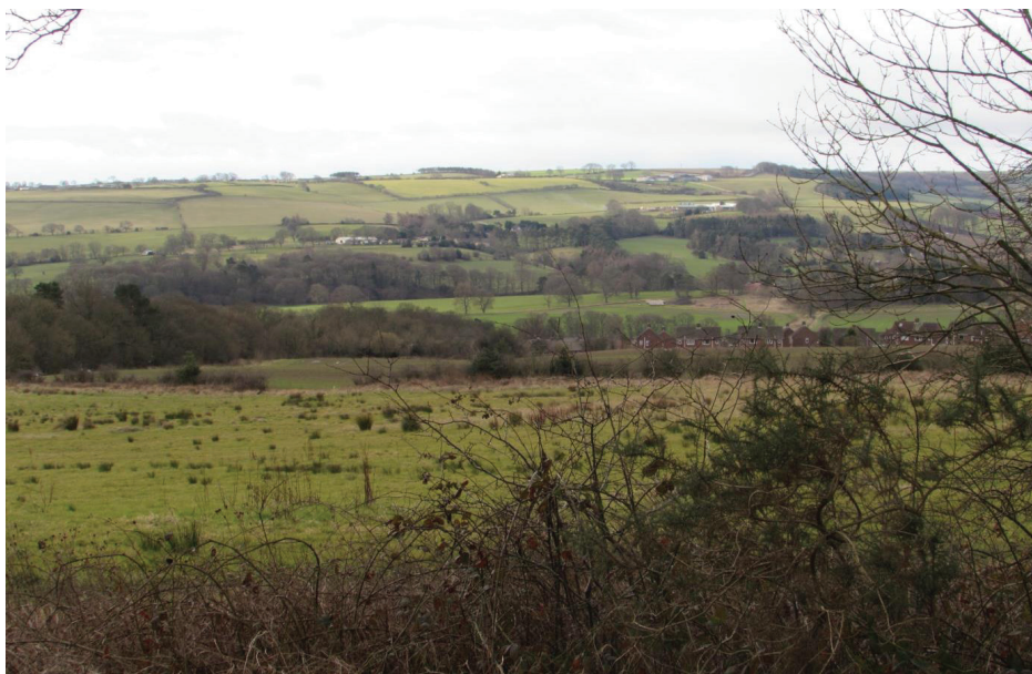
Fig. 30 LHA 52 View west across village from Peth Bank