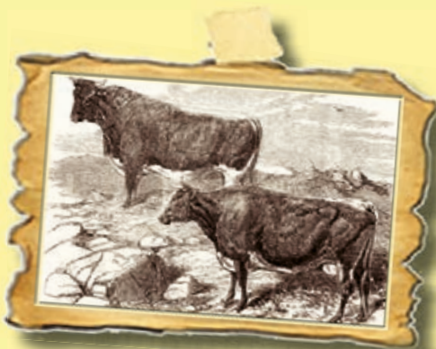
Some of the old cattle breeds are now rare or endangered

Drover's roads were used for herding livestock to market or new grazing. This route was travelled between Scotland and England.