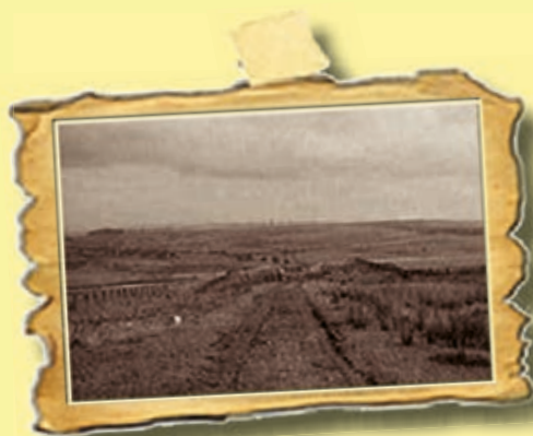
Nanny Mayer's Incline

Continue north to the junction with Waskerley Way and turn left towards Round Hill then, leaving the Waskerley Way, take footpath opposite Red House. Rejoining the Waskerley Way, cross and continue south-west with High Allotment on left hand side.