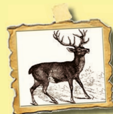
The Stag, favoured quarry in the bishop's hunting parks

At footpath crossroad turn left towards Salter's Gate.