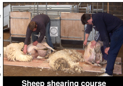
Sheep shearing course

You can also find details of everything happening on the Project and more on our website www.lanchesterparish.info or follow us on Twitter (LanchesterLM) and facebook (Lanchester Locality Map).