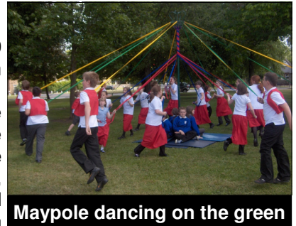
Maypole dancing on the green

The project, completed in May includes the introduction of a recreational path along the side of the burn as well as surface improvements to an area beside the church, the installation of a Parish Council information board and circular tree seat on