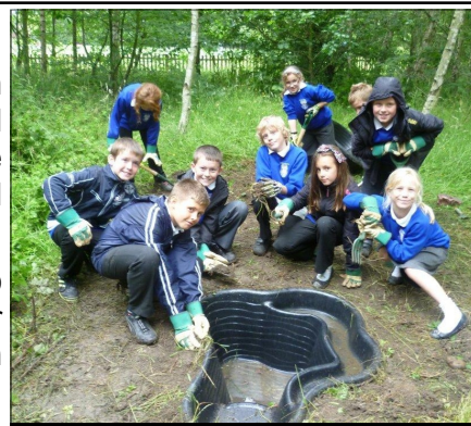
Making a splash Work on creating a pond

Work on other aspects of the Locality Map project continues with progress being made on the heritage walks and wildlife audit.