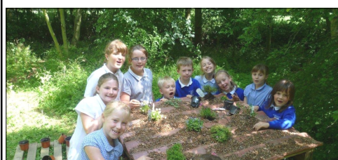
Creating an insect hotel

Over the last few months the primary schools in the Parish have become very involved in the Locality Map project. Sue Charlton the Locality Map Development Officer has visited the schools and provided a range of activities including: building insect hotels in the school grounds, an egg hatching project, mini-beast hunts, installing ponds in the school grounds, growing produce and visits to farms and local nature reserves.