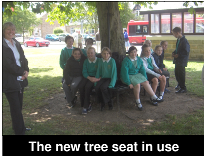
The new tree seat in use