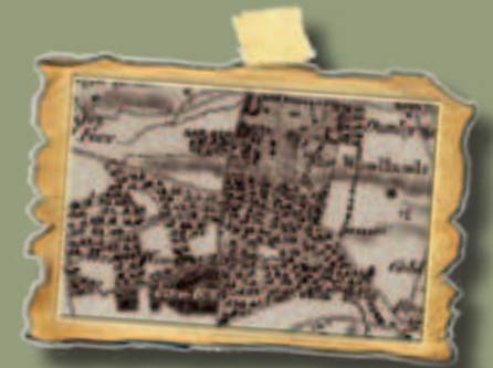
Greenwood's map of County Durham 1820

Turn right onto A6076 then left onto A692 and into the village.